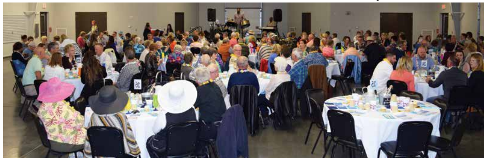
Variety Show 2016: The St. Paradise Band provided live steel drum beach music at the Foundation's annual Variety Show on November 13th at the Ag Hall in Deshler. The band was sponsored by The Struve Foundation, and approximately 240 guests were in attendance.