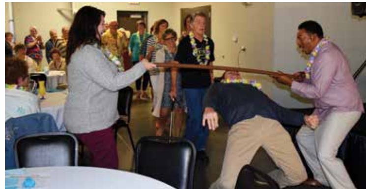
Guests participated in the limbo and a conga line.