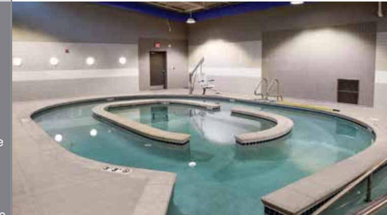
The aqua-therapy pool will be used by the Rehabilitation Services Department, as well as be available to the public during staffed hours. The pool has a reverse current to give you a better workout.

Make sure to be on the lookout for when it’s announced! “Like” Korff Fitness & Wellness Center and Thayer County Health Services on Facebook for the latest updates and information. To view weekly updates and pictures of the project and construction, check out www.thayercountyhealth.com .