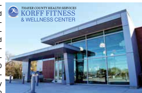
The front entrance to the Korff Fitness & Wellness Center.

The Korff Fitness and Wellness Center will provide the communities in and around Thayer County a full service, state of the art wellness facility. This 17,000 square foot exercise center will offer a wide variety of work out equipment to its members including